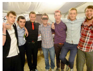
Guys in my tent at DCM

with Dublin Christian Mission. The first week was a family camp. I worked primarily with the teenage guys, sharing simple biblical truths. It was a blessing to watch God work in their lives. The second week was for 15-18s. I enjoyed being able to challenge the young men I was working with a little more. These young people struggle to apply God's truth. They have a head knowledge but we need to pray that God would help them to understand what it really means to have a daily relationship with Him.