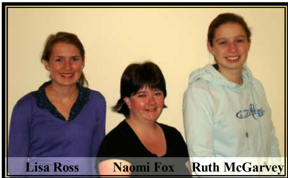
BIBLE COLLEGE STUDENTS HELPING WITH SUMMER OUTREACH